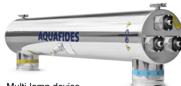
Multi-lamp device electropolished with tri-clamp flanges