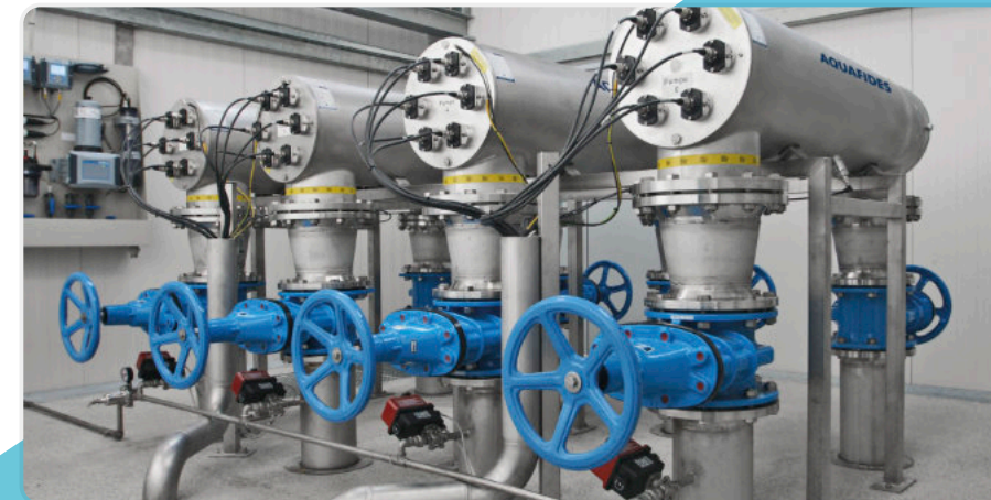
4 x 6AF400T Water Utility Krems (Austria)