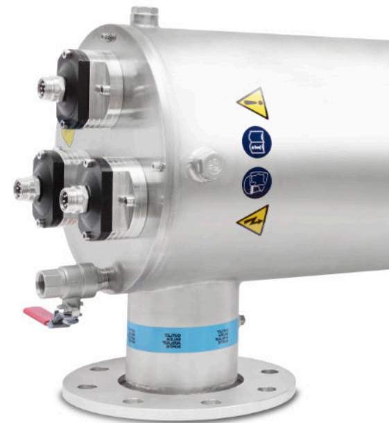
Multi-lamp system 3AF400T

The various UV disinfection units of the Compact series simply offer an excellent overall package.