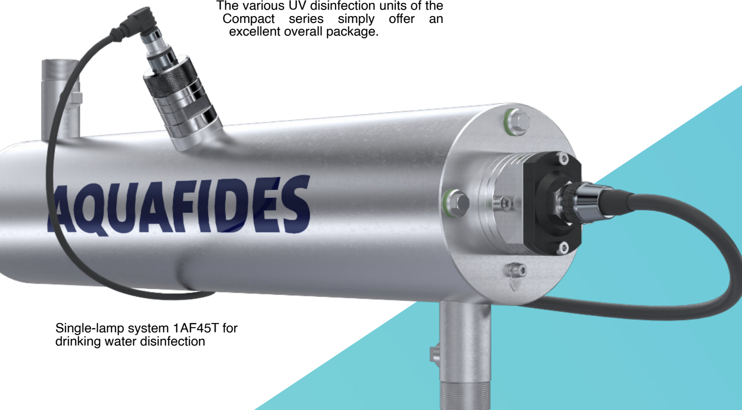
Single-lamp system 1AF45T for drinking water disinfection

From the compact single lamp unit for private households and small wells to the multi-lamp system with up to 12 UV lamps for water utilities, AQUAFIDES offers a complete product range. We support our customers with consulting and dimensioning as well as with the implementation of special systems.