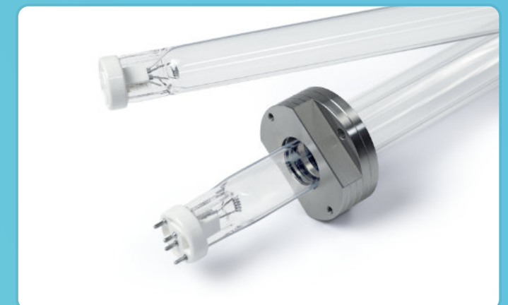
Lamp envelope tube with flange and UV lamp

Our customers can always rely on the quality and reliability of our UV disinfection systems. Should a spare part be needed (e.g. because a UV lamp has reached the end of its service life), we guarantee fast delivery times thanks to our extensive stock. With our 24h service we are always at our customers' disposal in case of emergencies.